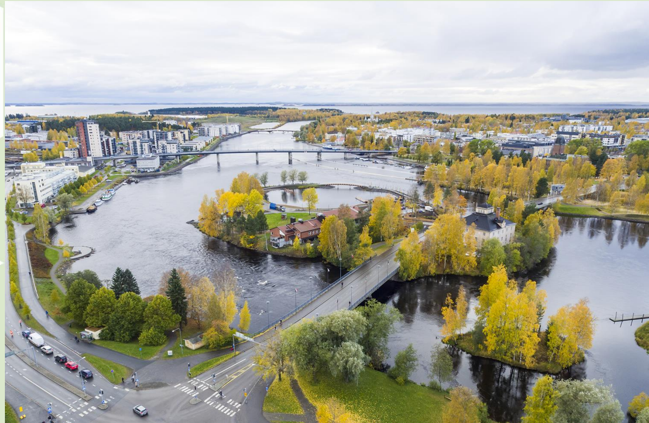
Sami Ruotsalainen / Smart and Sustainable Joensuu